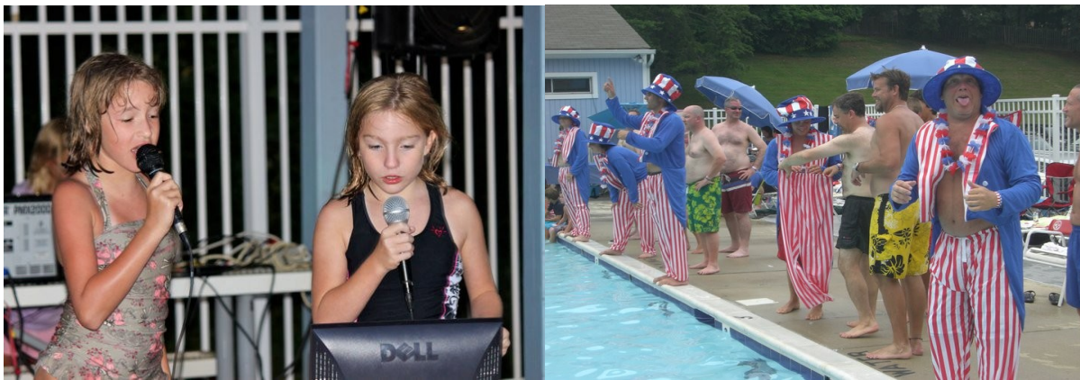
Photos from Chartridge summer events include Karaoke Night and the Adult Relay at the Independence Day Celebration.